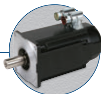
AKM® Servo Motor