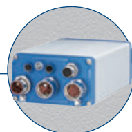
AKD®-N Servo Drive