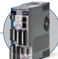
AKD® Servo Drive